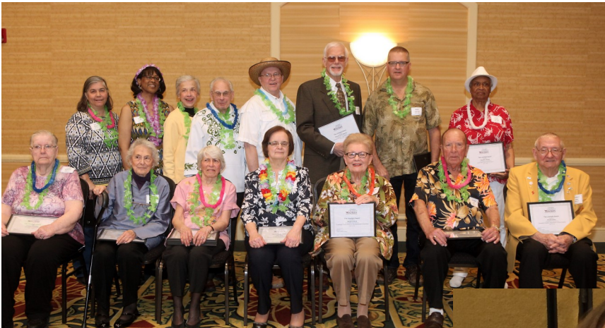
Limelight Award recipients. Congratulations!

Cleveland Hopkins Department of Port Control Great Lakes Science Center Cuyahoga County Board of Developmental Disabilities University Hospitals— Case Medical Center Greater Cleveland Volunteers—The Players Greater Cleveland Food Bank and The Arthritis Foundation Greater Cleveland Food Bank and The Arthritis Foundation Judson at University Circle Greater Cleveland Volunteers— AARP Foundation Experience Corps Hospice of the Western Reserve Greater Cleveland Habitat for Humanity Cleveland Hearing & Speech Center The MetroHealth System—Prentiss Center The Intergenerational School Euclid Senior Programs Murtis Taylor Human Services System Cleveland Botanical Garden